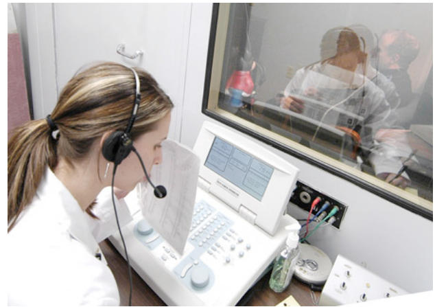
Figure 3. A hearing test is performed in a sound proof room. You will wear headphones or earplugs connected to a device that sends sounds of different volumes and pitches to one ear at a time. You will be asked to respond by raising your hand or pressing a button each time you hear a sound.